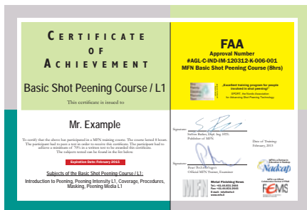
BASIC/Level 1 Certificate indicating FAA Ref. No.