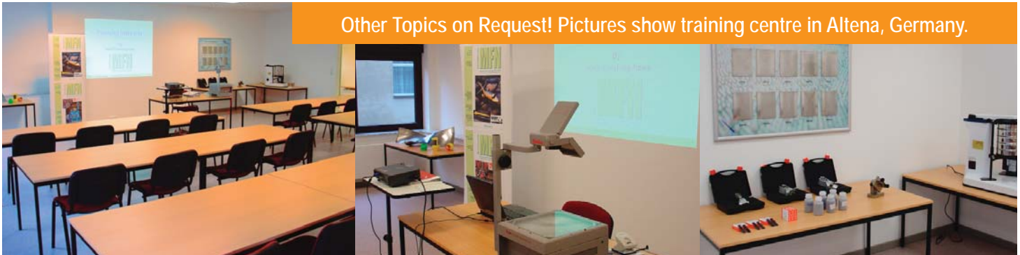
Other Topics on Request! Pictures show training centre in Altena, Germany.

Registration fax to +41.44.831 2645 (Switzerland) For questions call +41.44.831 2644 or E-mail: info@mfn.li