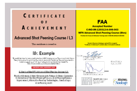
ADVANCED/Level 3 Certificate indicating FAA Ref. No.