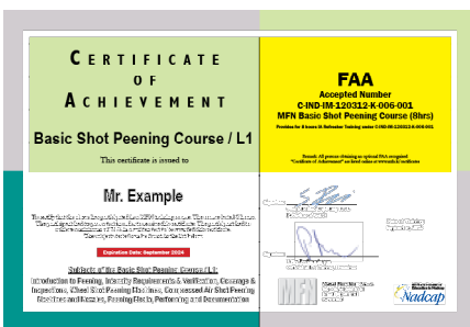
BASIC/Level 1 Certificate indicating FAA Ref. No.