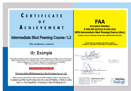
INTERMEDIATE/Level 2 Certificate indicating FAA Ref. No.